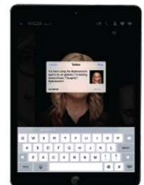
Share on Social Media Get the opinions of family friends