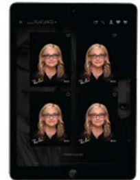
Find frames Thousands of styles rendered instantly in 3D

Employees have a realistic way to try on glasses digitally: