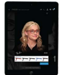
See from any angle See how frames look from side to side